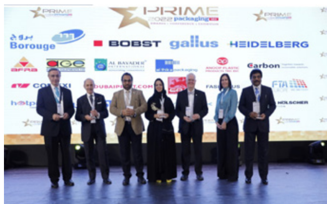
The jury of the Prime Awards.