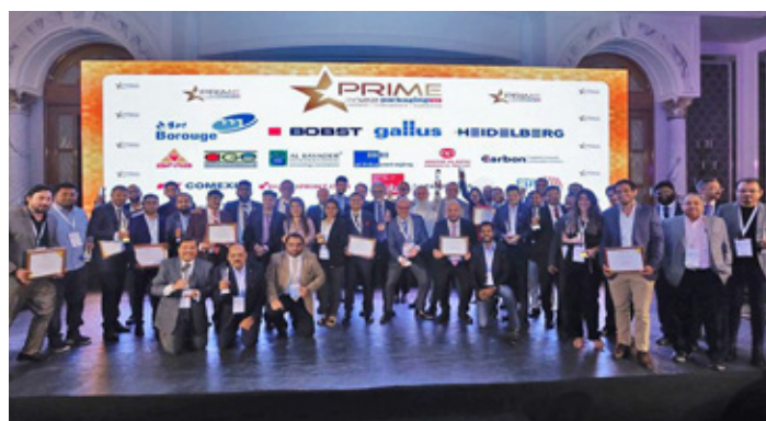
Winners of the 3rd edition of the Prime Awards.